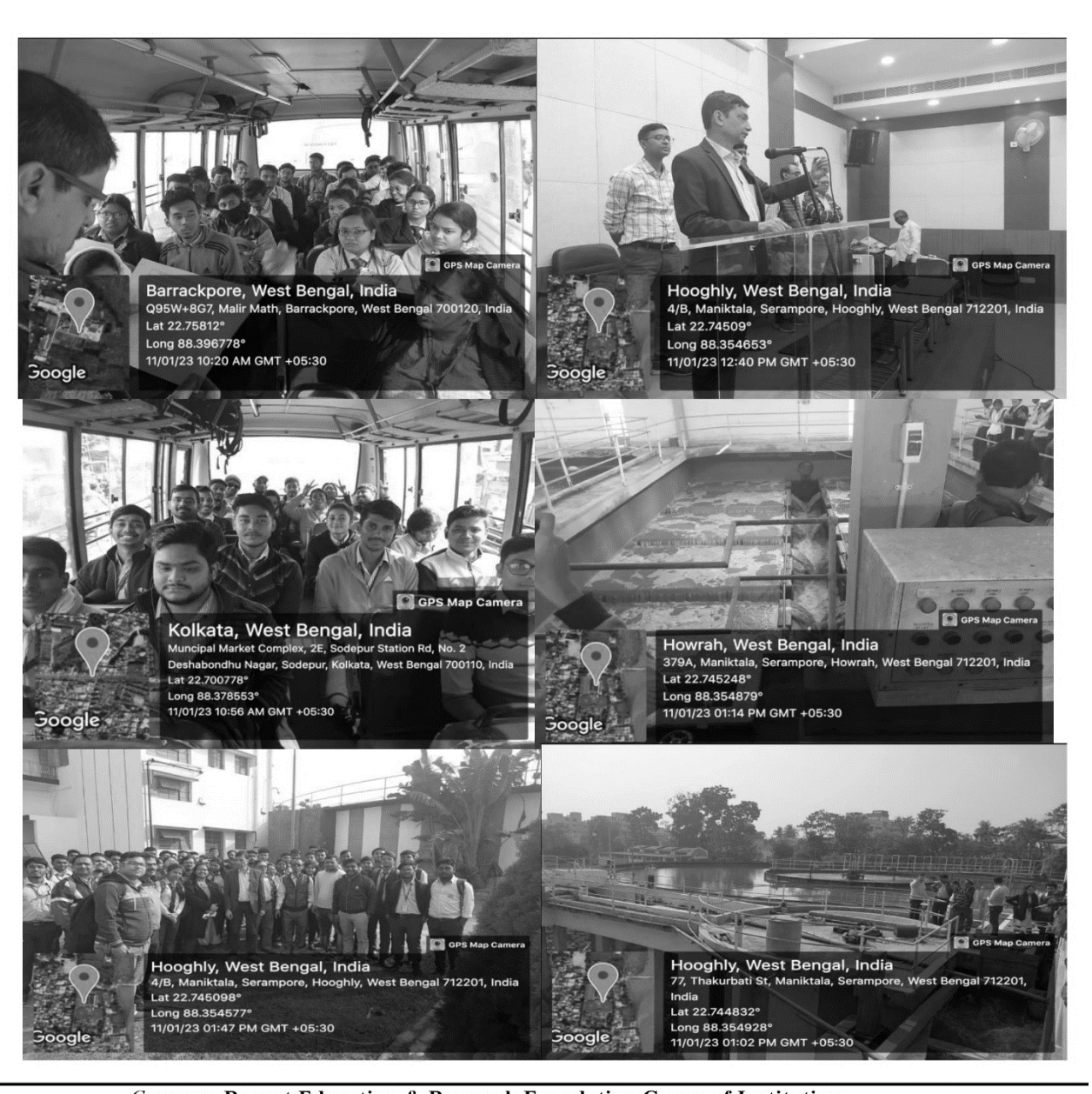
{\it Campus:} \textbf{Regent Education \& Research Foundation Group of Institutions}

E-mail: rerfkolkata@gmail.com, Website: www.rerf.in